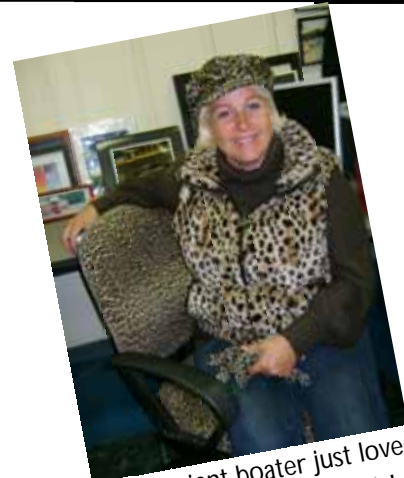
This transient boater just loved the fabric on the office chair!